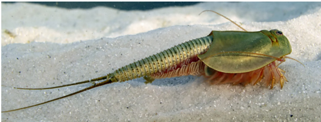
Triops australiensis

There are two species of Shield or Tadpole Shrimps found in Australia. In the north, a species called Triops is found, photo below .